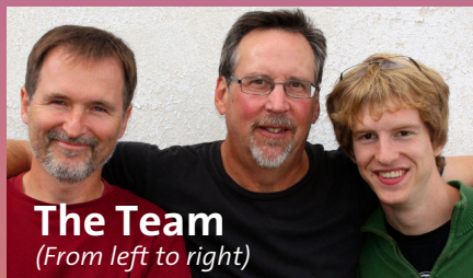
The Team (From left to right)

When failed L.A. music producer Nathan Williams returns to his Canadian hometown to rebuild his life, he's caught between the flower-child grandmother who raised him and her scrappy tomboy foster child who wants to become him. Through these three generations, we see how life is more often like a scratch track than a polished performance. Using character, situations, and music both funky and fine, "Scratch Tracks" mines the humour that comes from life in a small town where everyone wants to be a star.